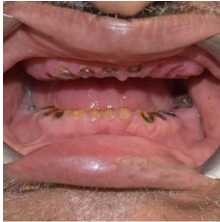
Figure 10: Case 3 Pre-operative.