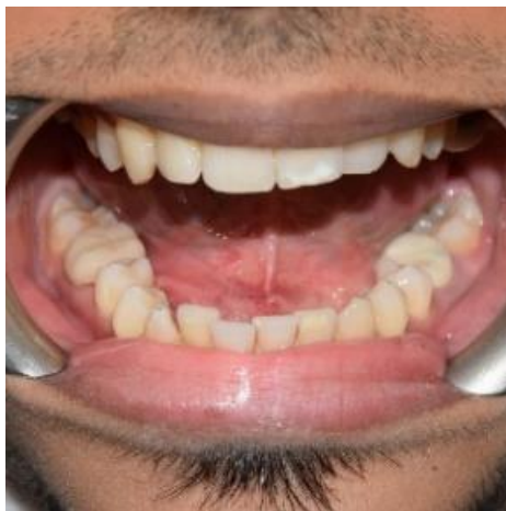
Figure 9: Case 2 Post-operative.

5. Definitive graphene-reinforced crown: A polymer based CAD-CAM crown was fabricated, designed to distribute masticatory forces across the post-core and root. The relatively low modulus and shock-absorbing behaviour of graphene-reinforced PMMA may reduce catastrophic root fracture risk compared with very stiff ceramics in such compromised roots [14-16]. Crown was luted with adhesive resin cement and occlusion carefully refined as shown in Figure 9.