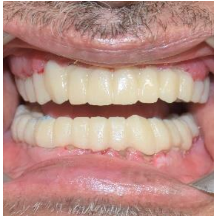
Figure 13: Case 3 Post-operative.