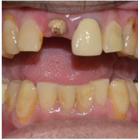
Figure 3: Case 1 During treatment.

4. Core build-up: A nanohybrid resin composite core was built incrementally to recreate the missing coronal structure and allow a >1.5 mm ferrule on the sound root at the cervical level, in line with literature on ferrule effect [3-5,13]. Gingival crown lengthening procedure was performed to get adequate height.