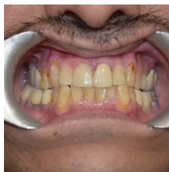
Figure 4: Case 1 Post-operative.