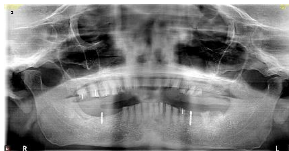
Figure 11: Case 3 Pre-operative OPG.