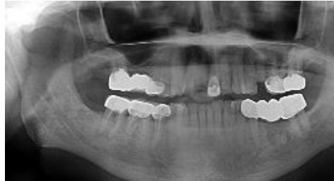
Figure 2: Case-1 Pre-operative OPG.

Diagnosis: Previously root canal -treated tooth with severe coronal breakdown (Ellis Class VIII) but with good root prognosis.