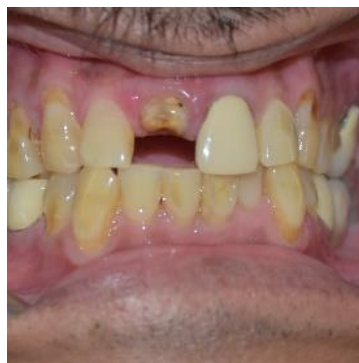
Figure 1: Case 1 Pre-operative.

The maxillary right central incisor had suffered trauma several years earlier. The clinical crown was almost completely lost, with a short-discoloured root fragment remaining at the gingival margin as shown in Figure 1.