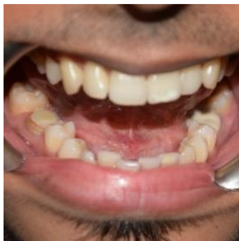
Figure 8: Case 2 During treatment.