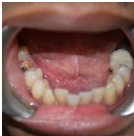
Figure 6: Case 2 Pre-operative.