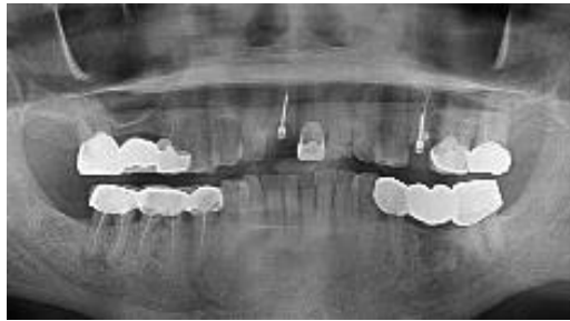
Figure 5: Case-1 Post-operative OPG.

At 3 year review, the tooth remained asymptomatic, with stable gingival margins, satisfactory colour integration and intact post-core–crown complex as shown in Figure 5.