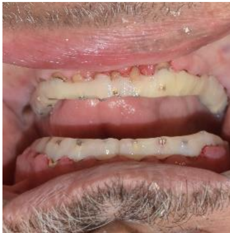
Figure 12: Case 3 During treatment.